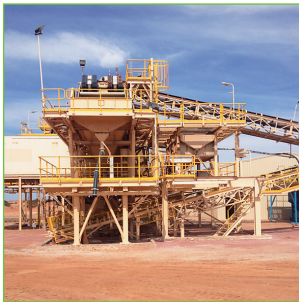
Bald Hill Tantalite Mine | Alliance Minerals

Targeted advice based on our analysis helps clients maximise plant shut-downs with prioritised recommendations for maintenance and rehabilitation works.